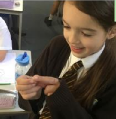
Disecting flowers and recognising the parts 🌸🌺🌻

Year 5 have been studying life cycles in Science. We have some 'budding' scientists among us!